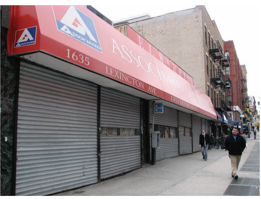
The Associated Supermarket at Lexington Avenue has been closed since January 2008.

"Supermarkets are closing in East Harlem. The reasons are varied and hard to define precisely, but it lies somewhere in the nexus between rising rents, higher food prices and increasing energy costs which effect everything from refrigeration to lighting to deliveries. The skyrocketing cost